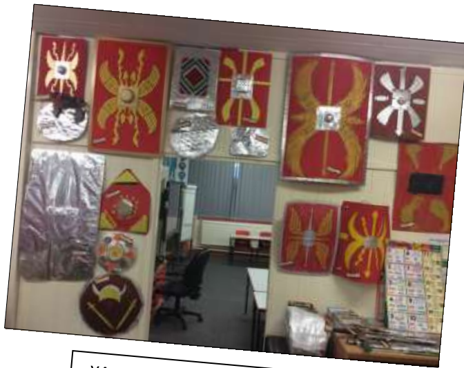
Y4 made some Roman artefacts