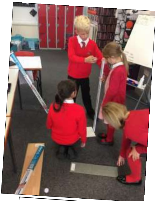
Y5 had a science investigation