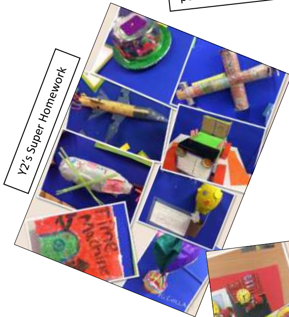
Y2's Super Homework