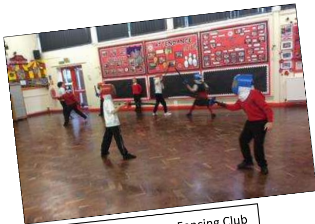
Children enjoying Fencing Club

Some pictures of activities from this week on our twitter feed