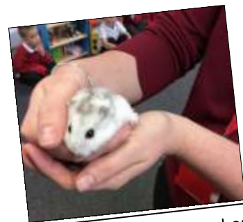
Reception are learning about pets and enjoyed meeting Oreo.