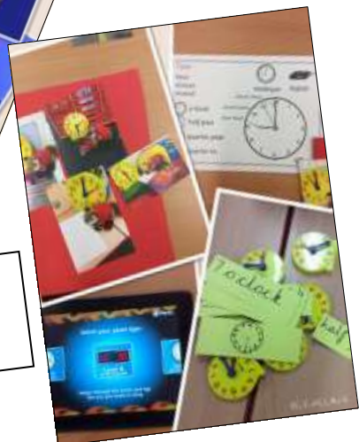
Y2 finding Fitzy and learning about time