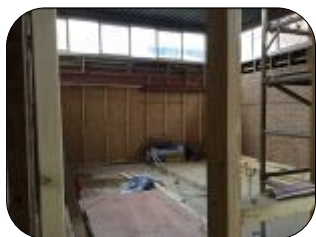
Our new Technology Room

Another busy week on site this week, with lots going on. The need for pipework and drainage for the new kitchen has meant that the old concrete kitchen floor is having to be dug up - a very noisy and messy job. As well as this, we have had the trench being dug in the front drive and pathway to lay the new electrical cable to provide additional power to the new classrooms and kitchen. Thank you for your patience and support during this disruption to getting into the school.