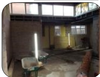
Our new Kitchen

Digging the foundations for the new classrooms