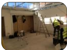
The technology room with lifting shutter into the hall corridor.

Following last Thursday's build meeting, we can now update you on build schedules. Due to a bit of a delay, the front classroom block is now due to be arriving and installed mid March. Watch out for the huge crane! This means that it will now not be ready to hand over to the school until the May half term. As a result, the demolition and replacement of the old mobile at the back of the school, with the new 2 classroom block, will not start until the summer holidays. This delay will mean a lot less disruption and inconvenience during term time, particularly for the KS2 children getting to the playgrounds, but it will mean that the building works will not be completely finished until October half term.