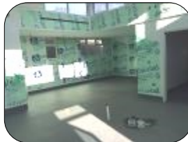
Kitchen (above) ready for the appliances to be fitted.

Internally, the new kitchen and technology room windows are in, the flooring is now down and 2nd fix electrics started, so the appliances may well start to be fitted next week. The current handover date for the new kitchen and technology rooms is March 16 th . We can't wait to be able to start doing cooking and other things in the new technology room, as well as having our school meals being cooked on site again. It's getting exciting now!