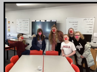
Red Nose Day Fun

We hope you enjoy reading about some of the things we have helped with this term. We would like to wish you all a very happy Easter and hope you all enjoy the break.